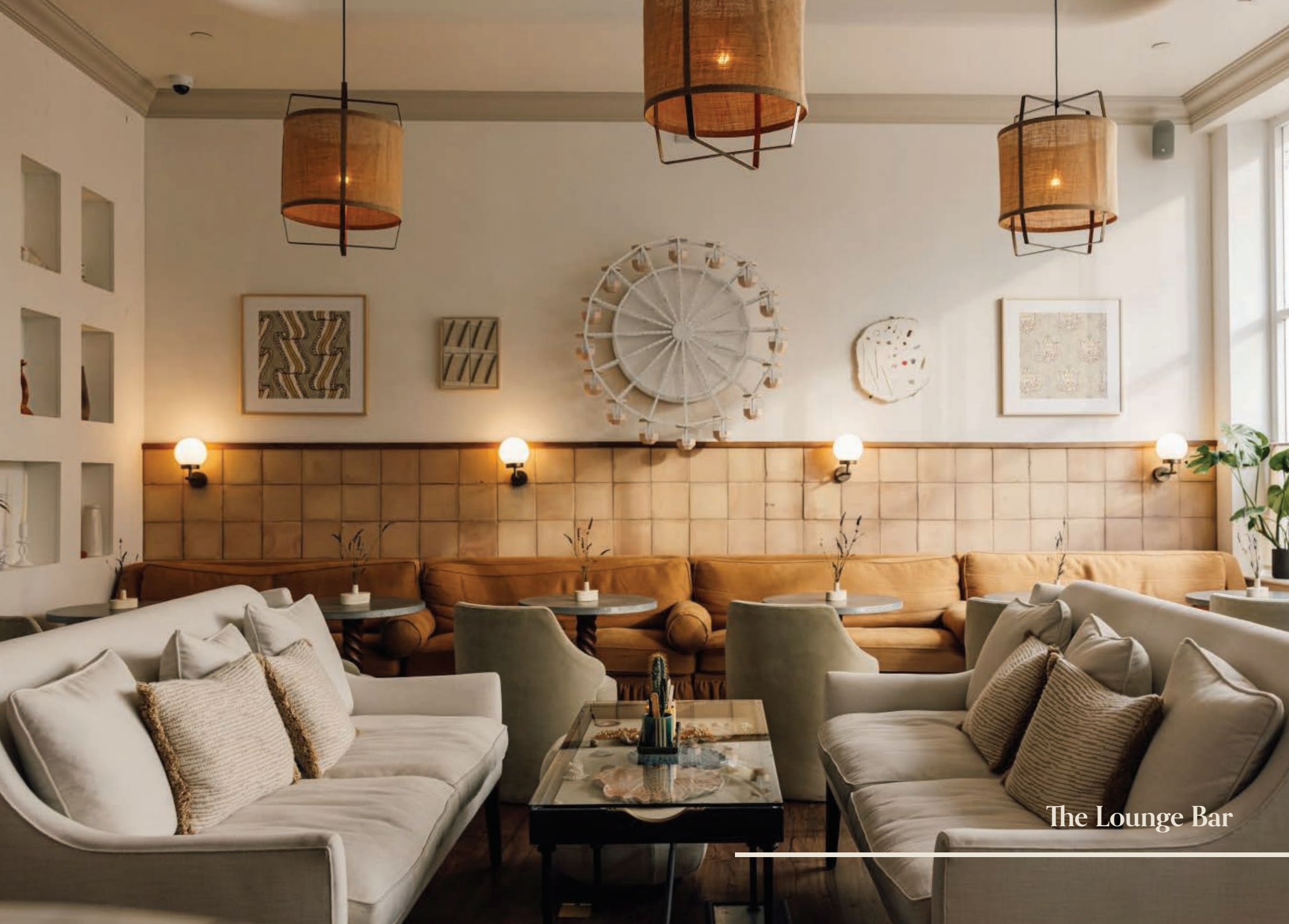
The Lounge Bar